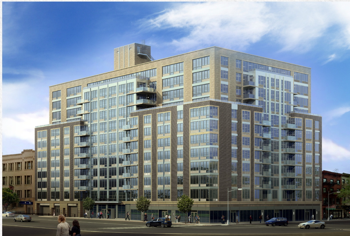
SEC OF 26TH STREET & EIGHTH AVENUE • NEW YORK, NY 10001